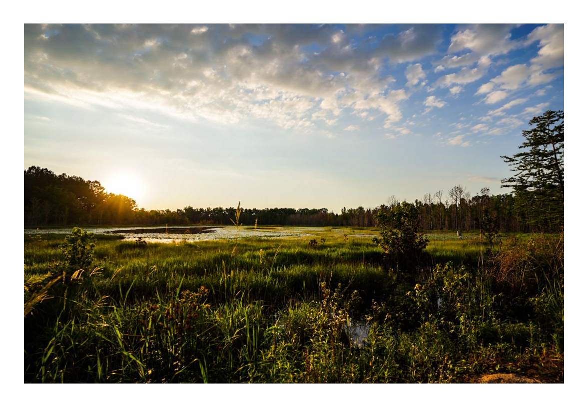
To the AMAZING individual coordinating your group's Camp Leopold trip...

Thank you for the time, and effort you're putting into organizing a Camp Leopold field trip for your students! We deeply appreciate you and look forward to the partnership that will be formed between you and our staff during this process. This Coordinator Packet will provide you with all the materials needed to ensure that you and your students are well-prepared for a positive and memorable experience at Camp Leopold. Thank you for making this experience possible for your students and peers! We look forward to serving you and your group soon!